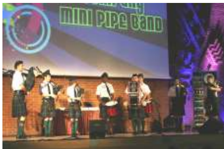
5th Croydon Mini Band