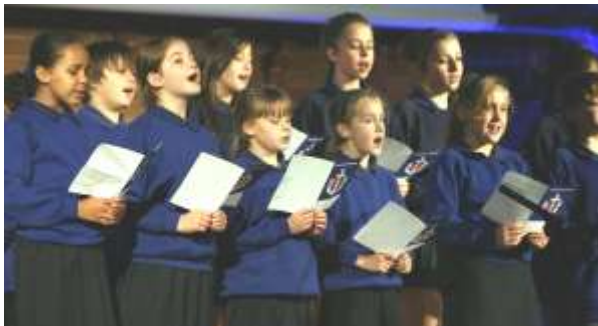
1st Barnet Choir

An excellent afternoon was enjoyed by all on the 9th October at the Great Hall, Kensington for the Jack Petchey Award Celebration event.