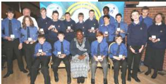
Award winners from the Kingston and Merton Battalion